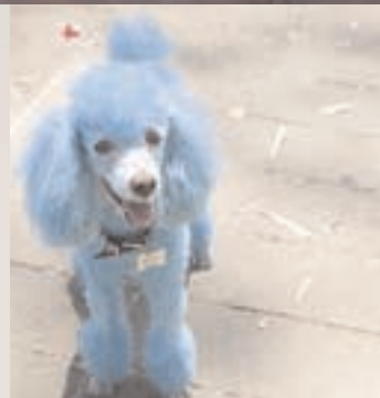
Painted poodle (artist unknown) on Avenida Alvaro Obregón. Right: Proyectos Monclava exhibition space at México Arte Contemporáneo