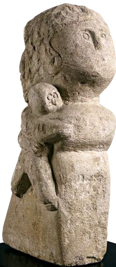
William Edmondson, "Mother and Child," c. 1939, carved Tennessee limestone. Adolf Wölfli, "Monmooria, Indien: Und, Martins=Nacht, imgrossen, Ost=Meer" (top), 1919, pencil and colored pencil on paper.